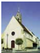
The church of Sainte- Marie-Madeleine