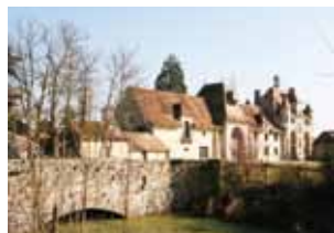
The castle and the staves