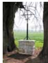
The Cross of Balle