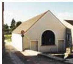
The wash house